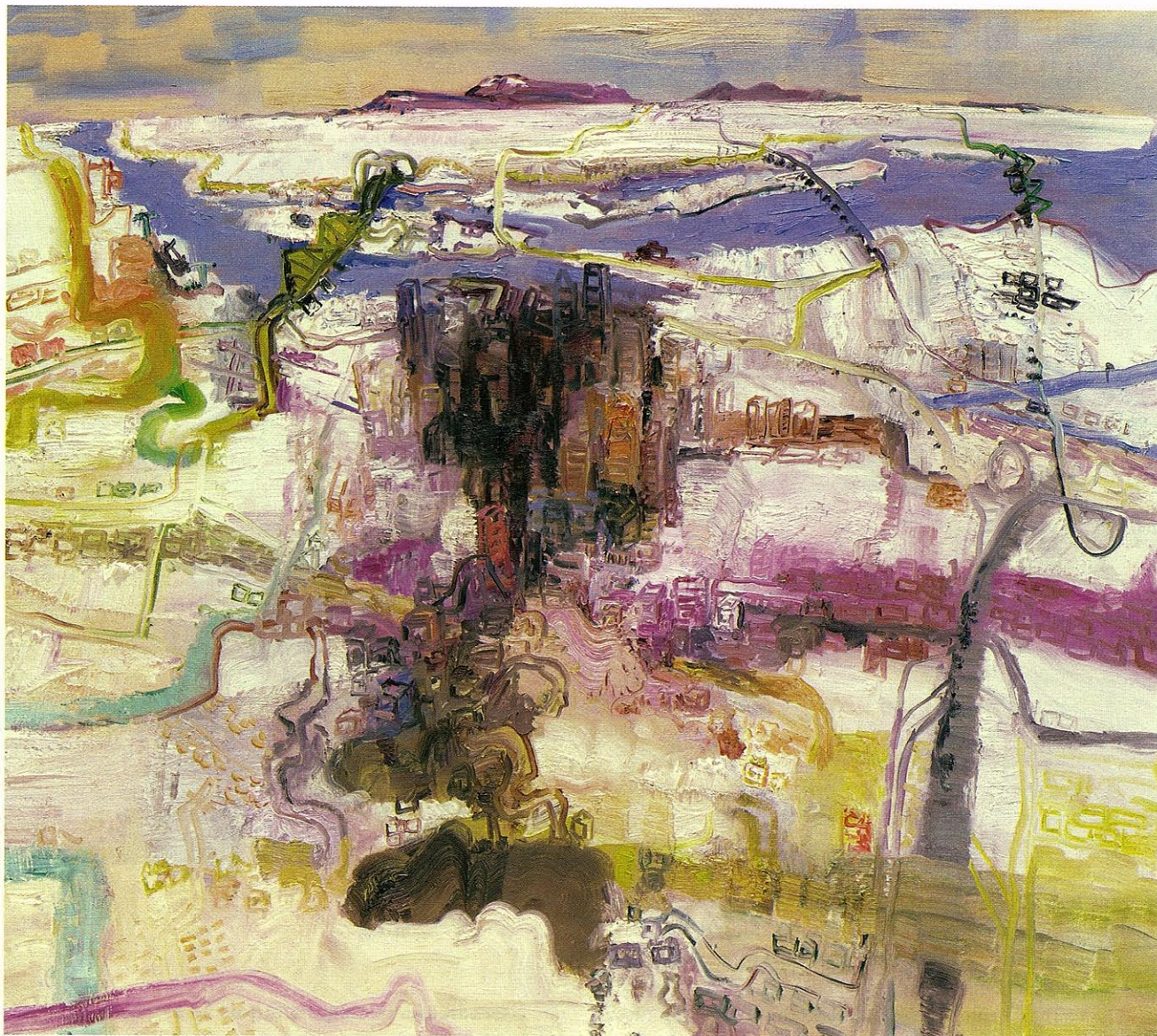
Montreal 2005 Oil on linen 1.21 x 1.37 m

sea. The painting keeps your eye moving until you reach the horizon, where Altdorfer decides to stop and put in the sky and the sun setting above the water. It's as if Altdorfer is saying that beyond the battle's reach, life goes on."